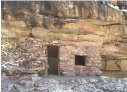
[Beamer Cabin – photo courtesy NPS, 2002.]

First, Amy explained about the Vanishing Treasures Initiative. Beginning in the 1990s, there were many retirements of skilled masons. Ruins stabilization began to suffer, so Congress passed a measure that used skilled seasonal employees to fill positions. Prehistoric ruins were assigned as specific projects to stabilize. The structures targeted were standing structures that were not being used for their original purpose.